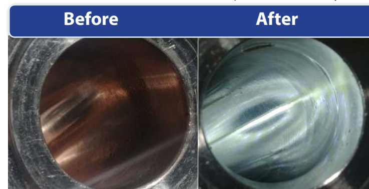
Difficult to clean elbow with scale build-up, resolved with OxyStrike.